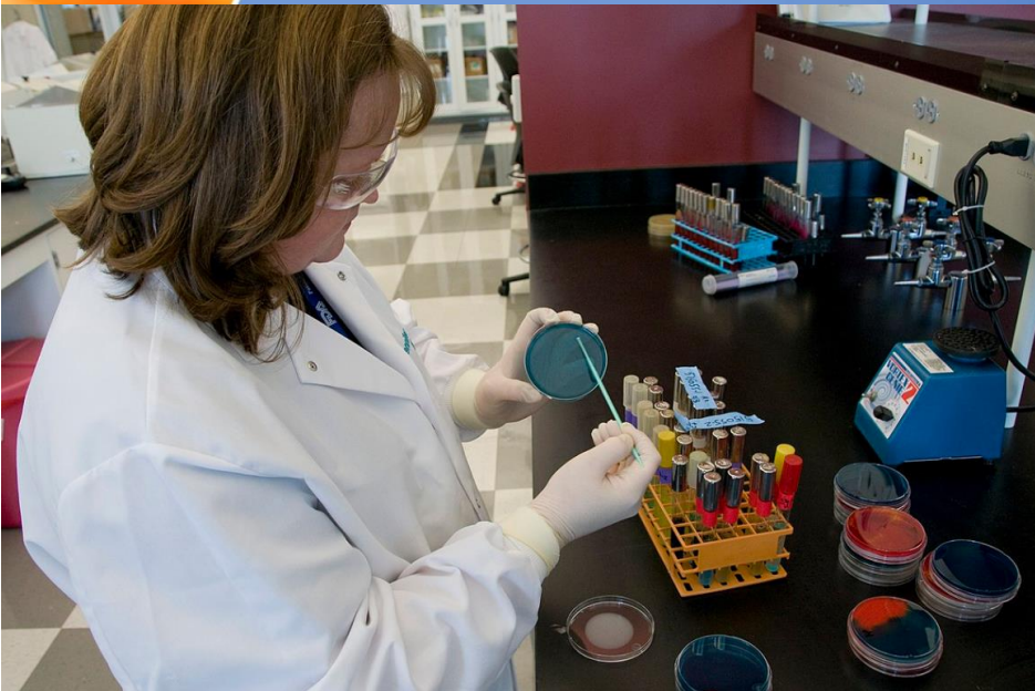
US Food and Drug Administration scientist tests for presence of Salmonella

Newsletter of the Florida State Agricultural Response Team